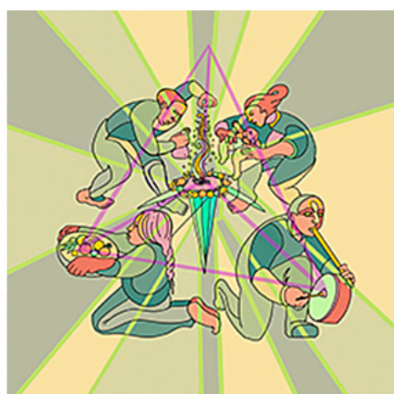
Kipi recordante/ Recording Kipi by Cooperativa Cultura 19 De Enero