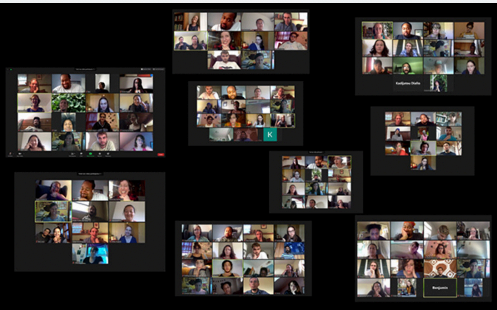
Class Portrait of the 2020 MDOCS Storytellers' Institute